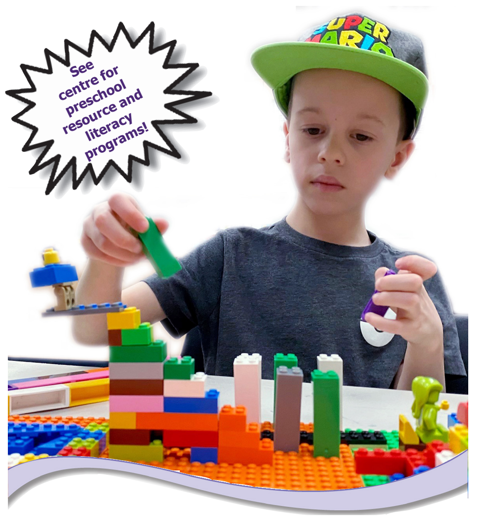
For full details on all our programs and events see www.airdriepubliclibrary.ca